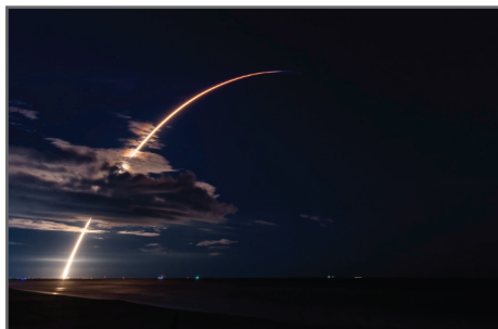
Image of a Starlink 4-34 launch