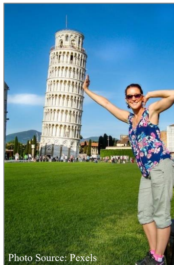
Figure 1: Example of forced perspective. The person in the foreground is much closer to the camera than the tower.

While no single explanation or method of analysis can account for all unidentified anomalous phenomena (UAP) cases received by the All-domain Anomaly Resolution Office (AARO), the effects of forced perspective and parallax can frequently explain excessively large sizes or high speeds described in UAP reports. In many cases, the reporter may be positioned far from the object being observed while moving fast relative to it. Under these conditions, an observer can misinterpret the apparent size and speed of a UAP due to the two separate but related phenomena of forced perspective and parallax. This paper provides a basic overview of these phenomena and their impact on UAP observations.